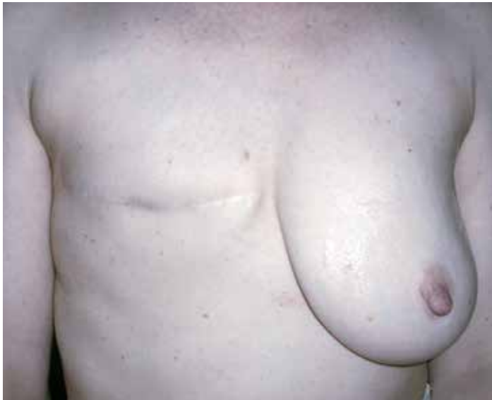
Mastectomy of the right breast

After a mastectomy, you will have a scar that runs across or down your chest. The scar will become less obvious with time. The picture below is of a woman who has had a mastectomy. You might want to ask your surgeon to show you some other pictures of women who have had a mastectomy.