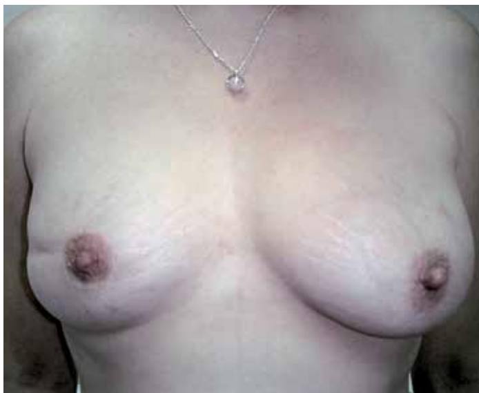
Breast conserving surgery of the right breast

You may want to ask your surgeon to show you some pictures of other women who have had breast conserving surgery.