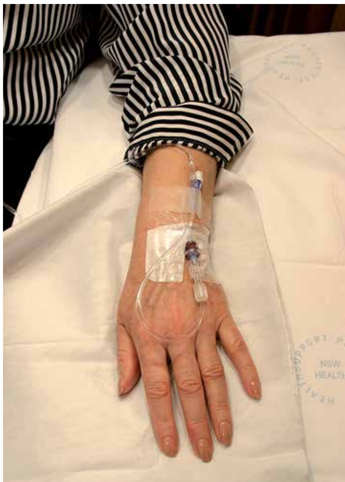
Delivering intravenous chemotherapy into the blood stream